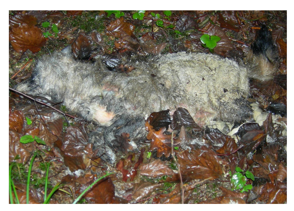
Fig. 3. Raccoon dog with sarcoptic mange